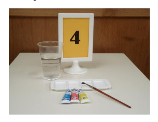
Figure 4 – Lab Station 4

In the Lab Station 4, students were required to mix paints (gouaches) and predict the perceived resulting colour. Also, in this experimental station, the students manipulated magenta, yellow and cyan filters and had to demonstrate the results observed (Figure 4). The lab worksheet and all the material used in the lectures and in the lab are available, in Portuguese<sup>1</sup>.