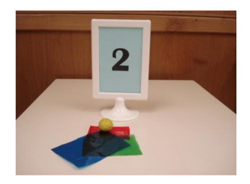
Figure 2 – Lab Station 2

Figure 3 shows an example answer (in Portuguese) of one of these types of questions in Lab Station 2. In this task, students predicted the following situation: What does a yellow plasticine (with visible light) look like when covered with a blue cellophane and illuminated by a yellow incident light?